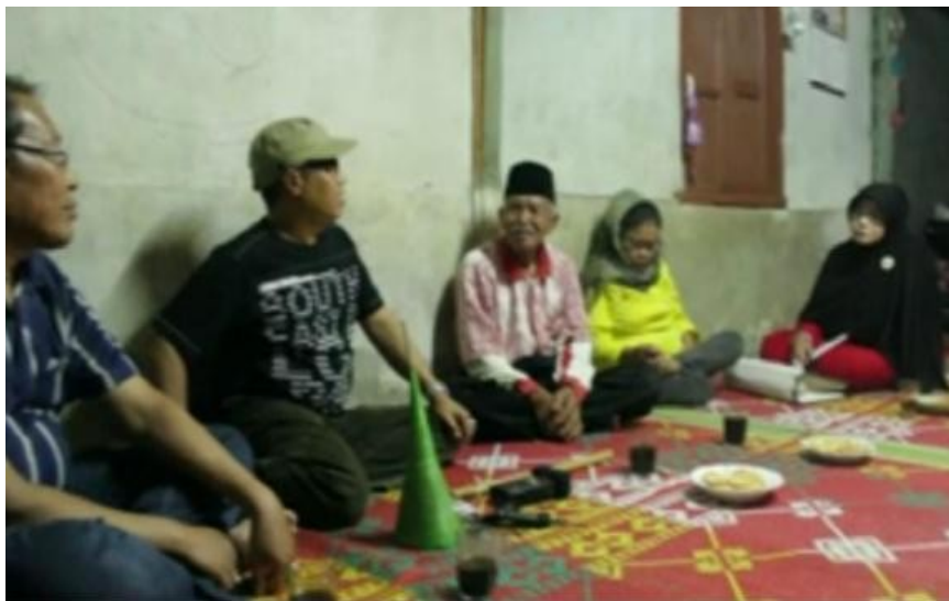
Fig 3: Photo of pupuik gadang

Fourth, pupuik gadang is a kind of wind instrument that has multiple reed made of rice straw and then given a hollow gotten from the structure of twisted coconut leaves as resonance. This musical instrument had a role as the variable of melody in the play of talempong music ensemble.