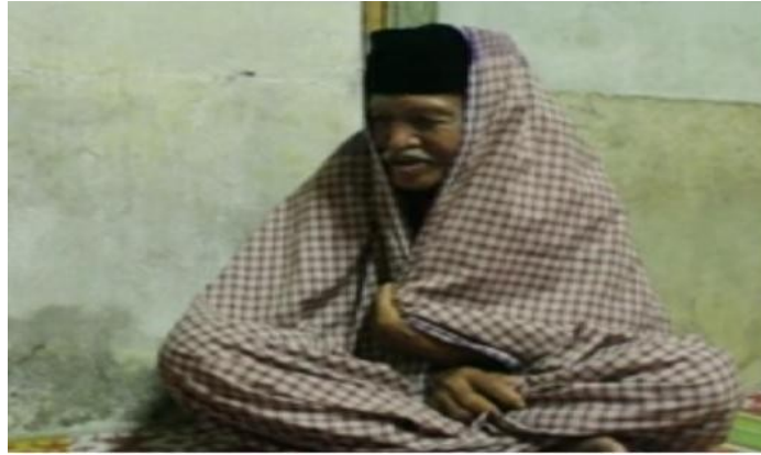
Fig 7: Silungkang Tuo lament singer