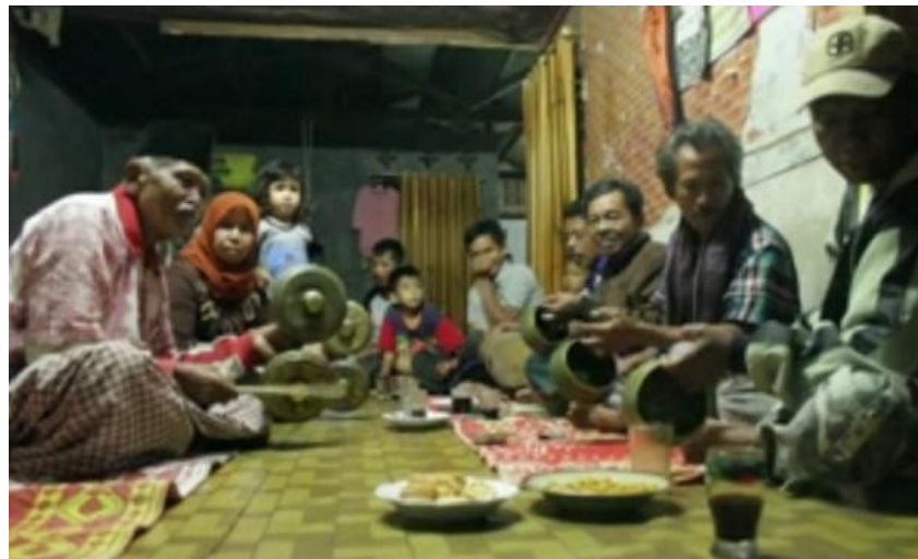
Fig 1: Photo of talempong

Musical instruments played in the ensemble of cavalcade music consist of several kinds of musical instrument. First kind is seven talempongs made of bronze with the sort of idiophone classification of bepencu gong. Those seven talempongs are divided into 5 units of talempong namely (1) unit of Pamulo talempong consists of one talempong; (2) unit of Aguang talempong consists of one talempong; (3) unit of Panariang talempong consists of one talempong; (4) unit of Pambao Lagu talempong consists of two talempongs; and (5) unit of Paningskah Bunyi talempong consists of two talempongs. Each unit of those talempongs was played by mutually filling-in, intertwining, and interlocking each other (or interlocking system).