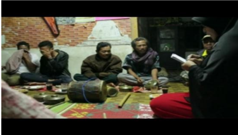
Fig 2: Photo of tambua

Third, gandang is a kind of drum that has cylinder form resembling the musical instrument of tambua but its size is smaller than tambua namely its diameter is approximately 20 cm. This musical instrument of gandang had a role in playing rhythm as variable in the fusion of talempong ensemble play, particularly variable from the rhythm play of gandang tambua.